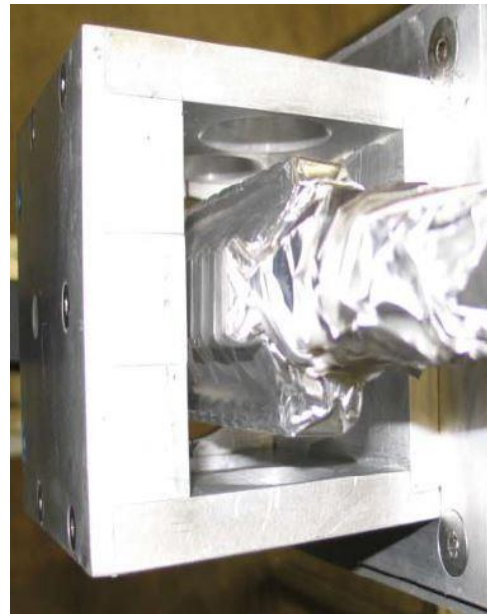
For Grip Mold

Please feel free to contact us for current pricing or with any other testing needs.