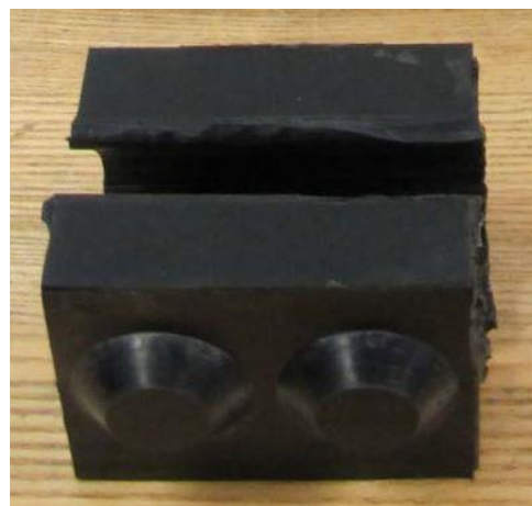
For Grip Insert